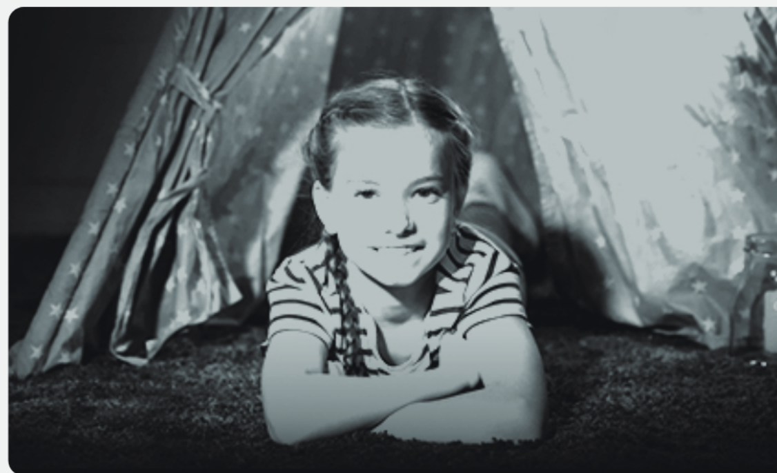
Without Smart IR

With Smart IR, the intensity of the infrared LEDs automatically adjusts to prevent overexposure in night vision mode, so you will get more details of the object or person captured at night.