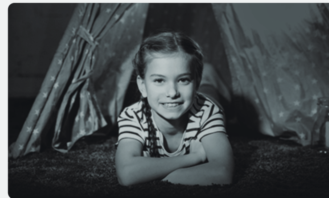
With Smart IR