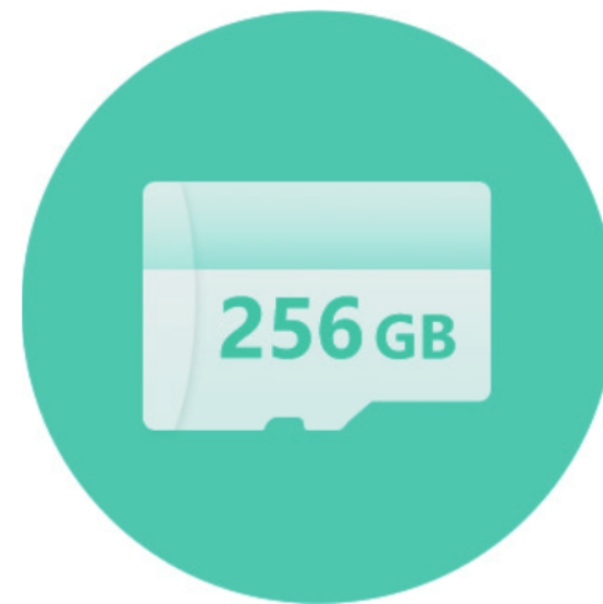
Supports MicroSD Card

*Cloud storage service is only available in certain markets. Please verify the availability before making any purchase.